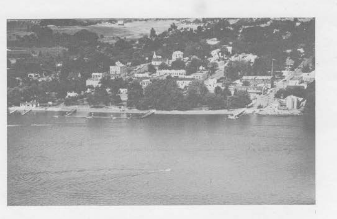
SKIING . BOATING . SAILING SWIMMING